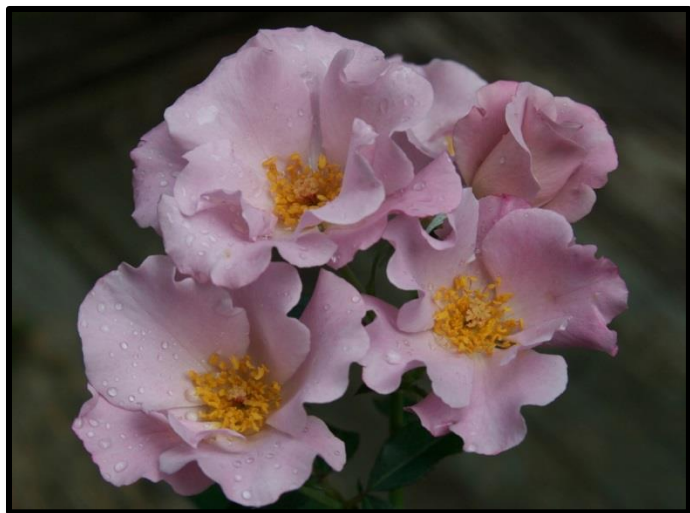
'Charlotte Ann' – Floribunda, 1993