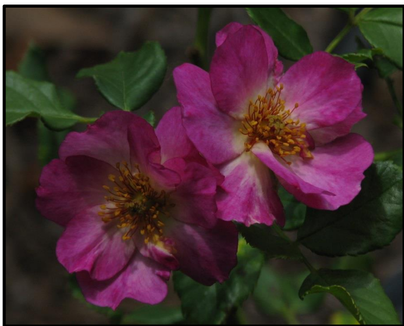
'Puppy Kisses' – Floribunda, 2011