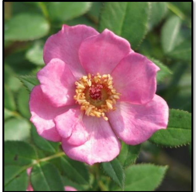
‘Lavender Simplex’ – Miniature, 1984