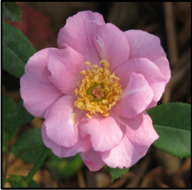
‘Angel Darling’ – Miniature, 1976