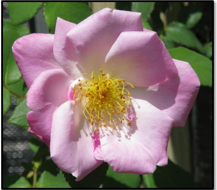
seedling from 'Blue For You'