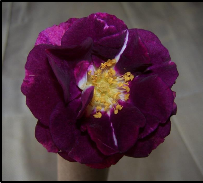
'Rpeacock' – an unreleased seedling out of 'Rhapsody in Blue'

Where to end? Hopefully the story continues . . .