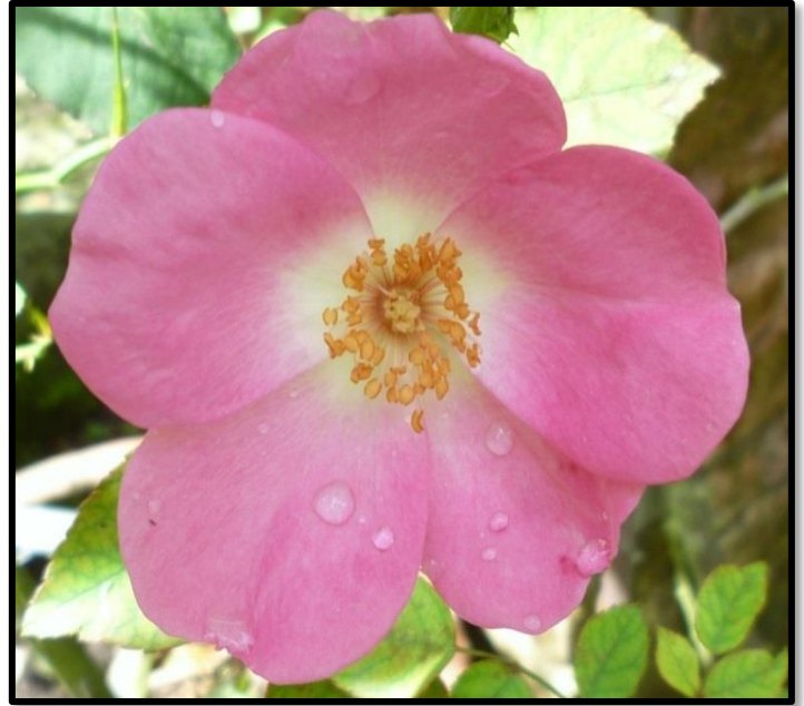
'Rose Legend' (Akira Ogawa) – the first recurrent seedling out of a new Japanese R. laevigata sport; pink to lilac