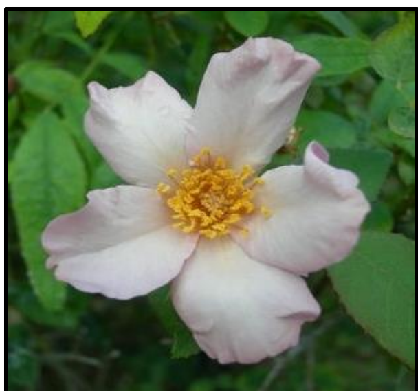
Upper left: 'Lilac Charm' – Floribunda, 1962