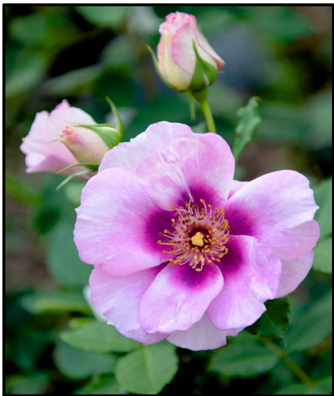
'Eyes For You' – Floribunda, 2009