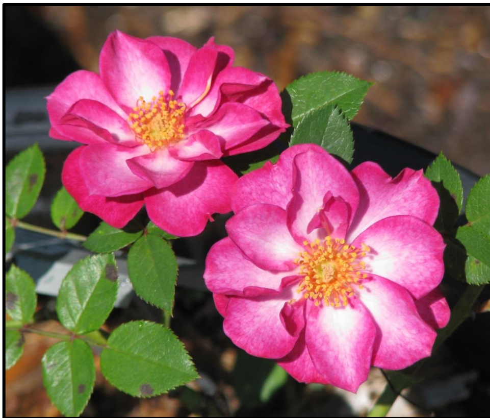
‘Make Believe’ – Miniature, 1986