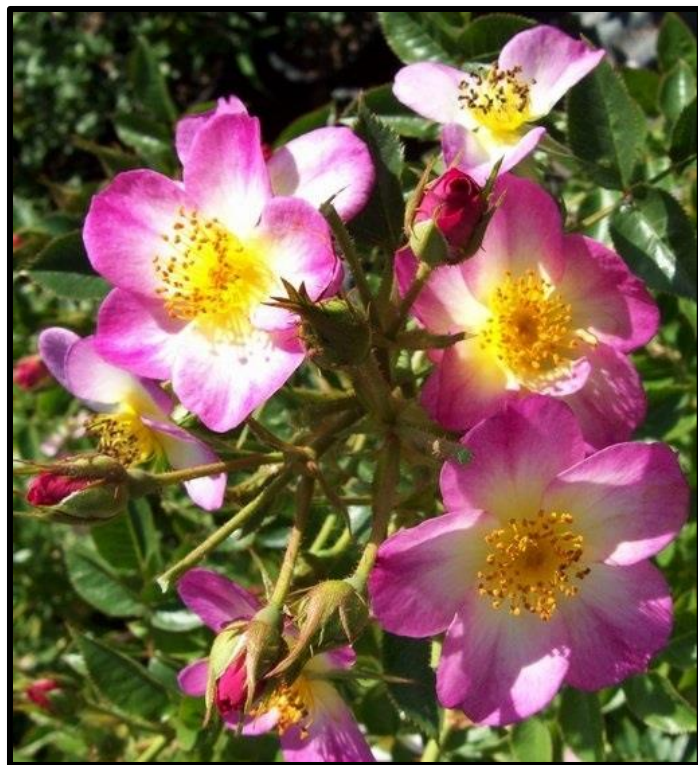
'Brindabella Gem' – Shrub, 2010