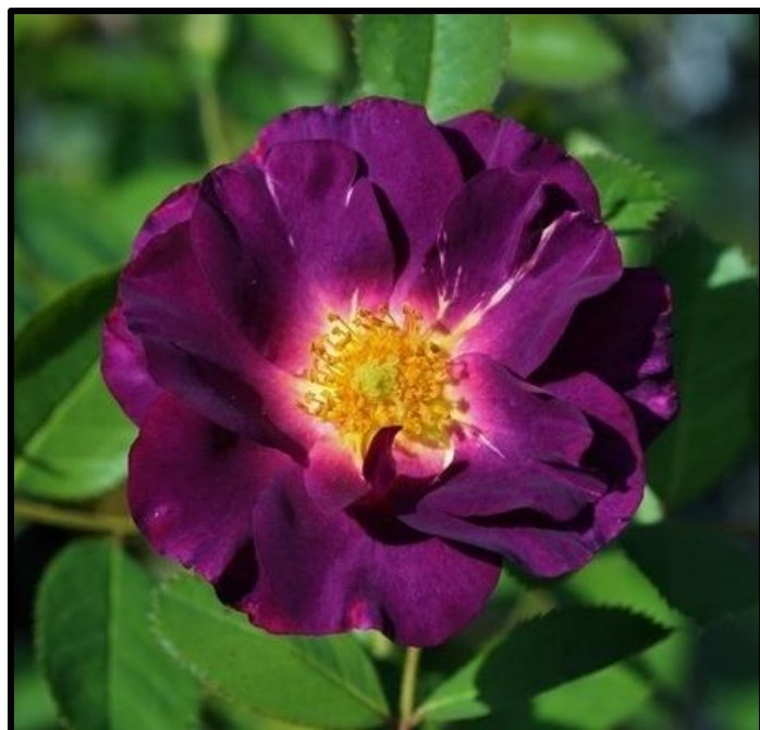
'Stormy Weather' – Large-Flowered Climber, 2010