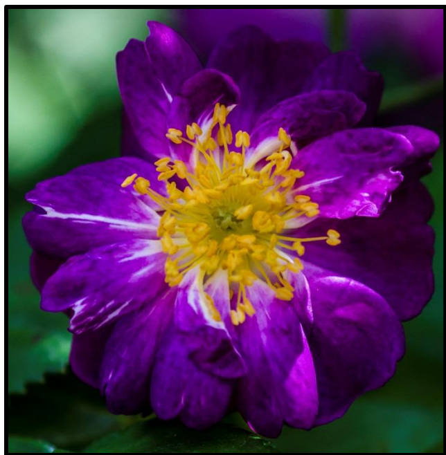
'Veilchenblau' Hybrid Multiflora, 1909