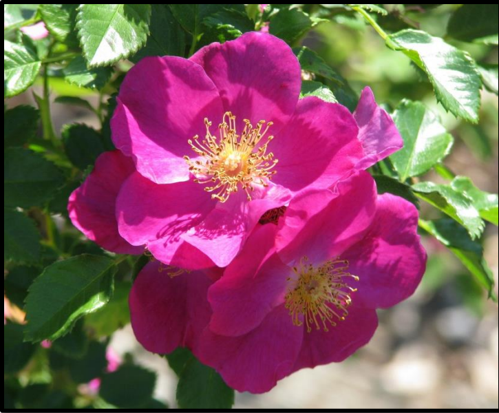
'Manhattan Blue' – Floribunda, 1990

The following group of roses is a miscellaneous one, including a broad spectrum of classes.