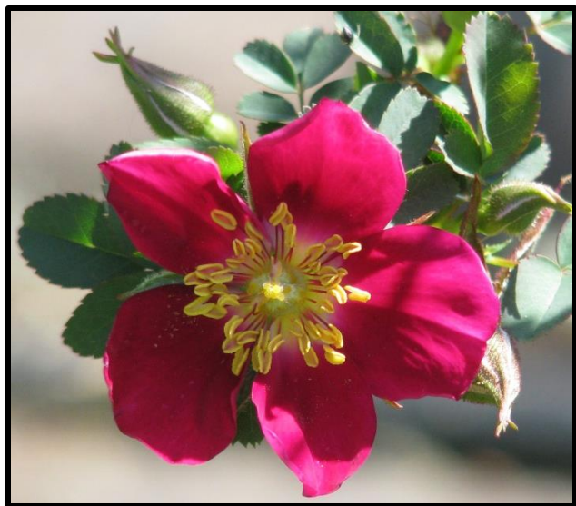
'Doorenbos Selection' Hybrid Spinosissima, ca. 1950