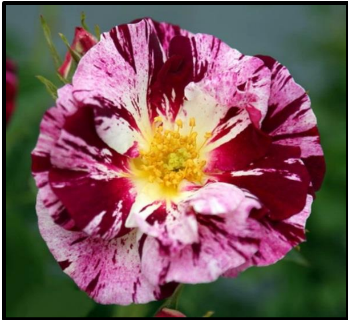
'Purple Splash' – Large-flowered Climber, 2010 Photo unattributed