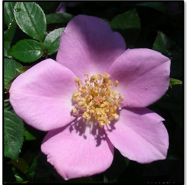
'Lavender Spoon' – Miniature bred from rose at left, 1995