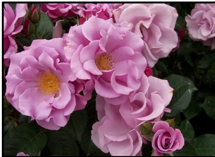
'Blueberry Hill' – Floribunda, 1996