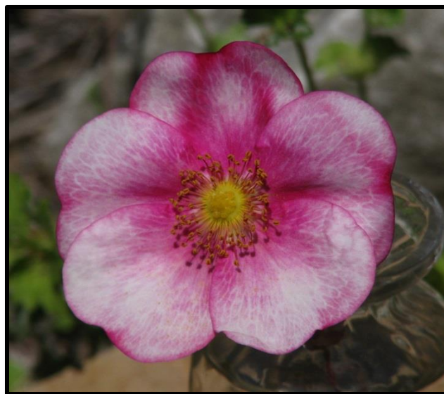
'Mary Conway' – Spinosissima seedling from rose at left; 2015