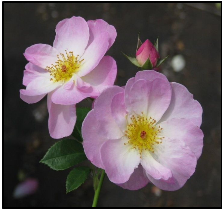
'Escapade' – Floribunda out of 'Baby Faurax,' 1967