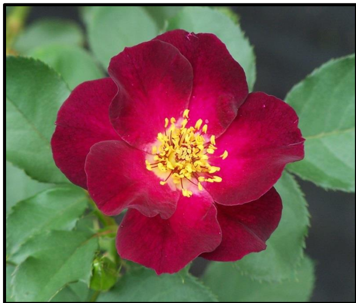
'Route 66' – Shrub, 2001

Tom Carruth's work with several complex hybrids involving 'Sweet Chariot,' 'International Herald Tribune,' and a host of other "blue" roses has resulted in a varied and extensive family tree. In addition to Tom's contributions numerous hybridizers, both professional and amateur have jumped on the purple bandwagon. Here are some of the single or semi-double varieties.