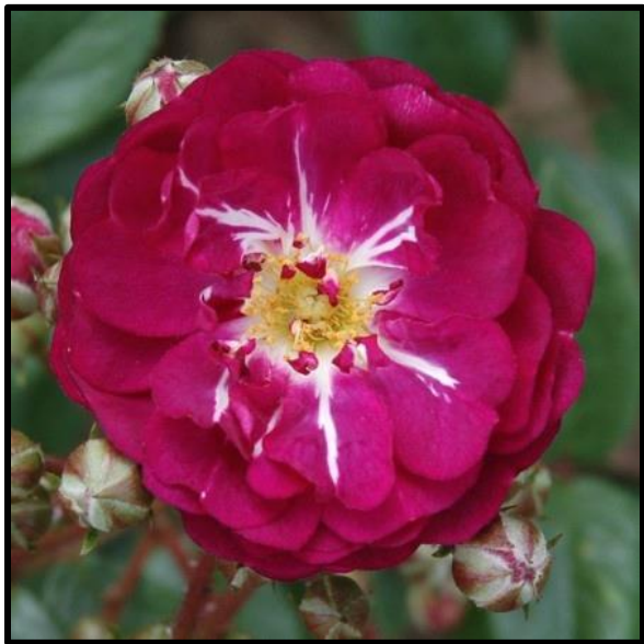
'Baby Faurax' – Polyantha, 1924