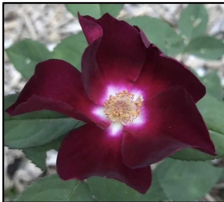
'Light My Night' – Climber/Shrub, 2013