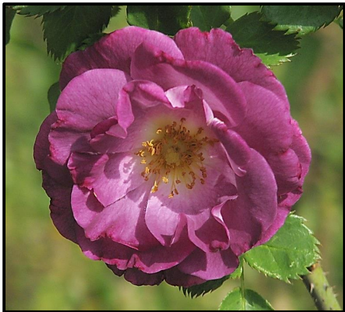
'Blue For You' – Floribunda, 2006