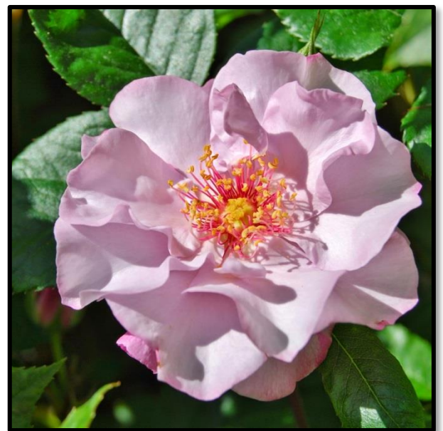
'Odyssey' – Floribunda, 2001