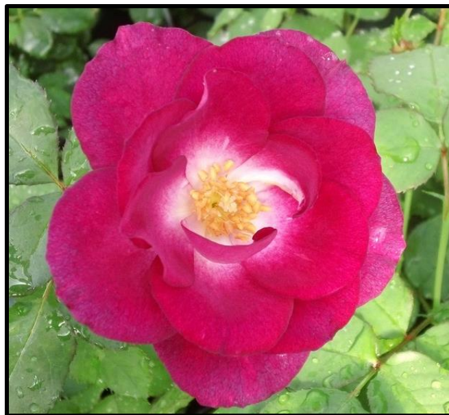
'Plum Frost' – Shrub, 2007