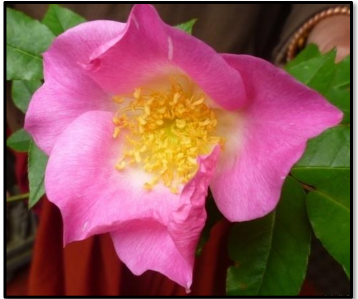
'Mia Grondahl' – Hyb. Gigantea, < 2014