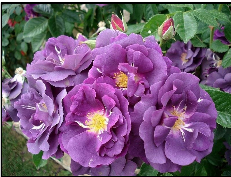
'Rhapsody In Blue' – Shrub, 2000

As mentioned at the beginning of this feature the introduction of Frank Cowlishaw's 'Rhapsody in Blue' in 2000 resulted in an explosion of rose hybridizing. It involved a complex hybrid involving 'International Herald Tribune,' 'Blue Moon,' 'Montezuma,' and 'La Belle Sultane,' crossed with a little-known Kordes climber 'Summer Wine.' The latter was used to produce several additional mauve-tinted cultivars that have become quite popular.