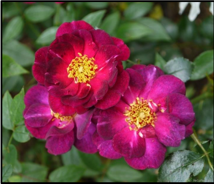
'Blue Peter' – Miniature, 1983, De Ruiter