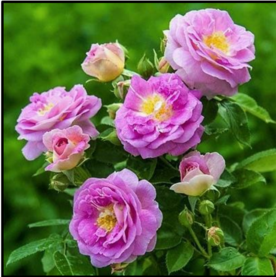
'Arctic Blue'