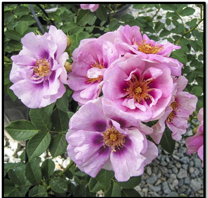
'Easy On The Eyes' – Shrub, 2016