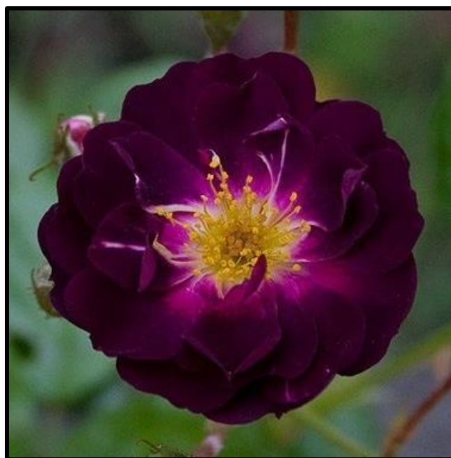
'Violette' Hybrid Multiflora from rose at left, 1921